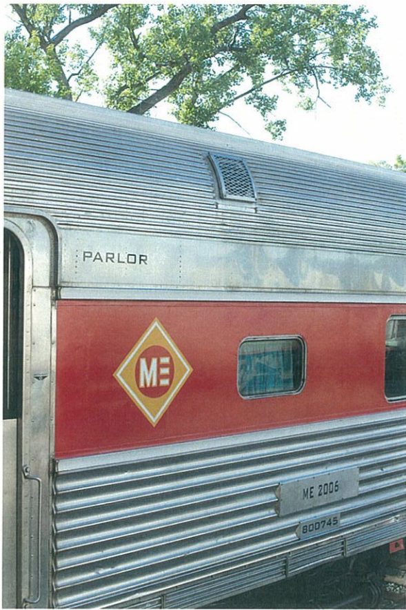
^ Formerly a congressional car that ran between NYC and Washington DC, our 1960's railcar had an old-fashioned style that reminded us of being in an old movie.