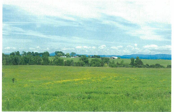
^ If we turned our heads for only a second, the landscape outside the window was bound to change drastically. Seeing New York from this perspective felt so rare and special.